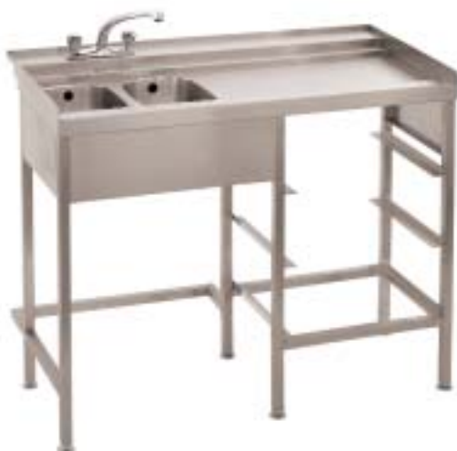
'B1' type glasswash unit 1250 long x 650 wide x 1000 high supplied with basket rack or clear under drainer for machine.