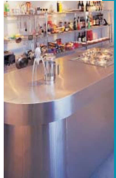
Curved stainless steel worktop with recess for a chopping board and hob by others.