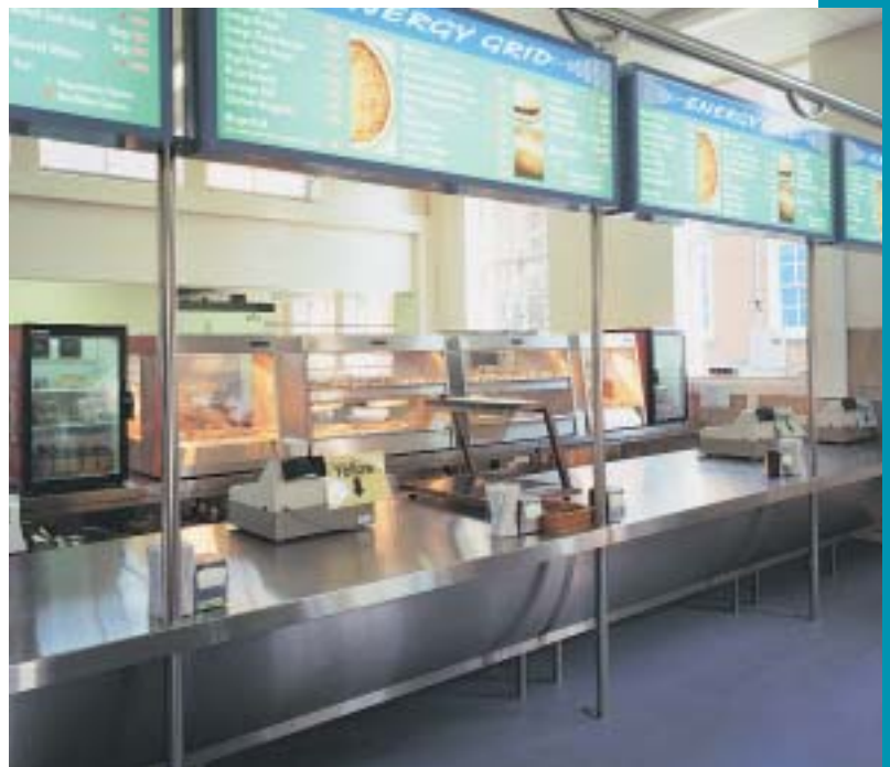
School fast food counter in stainless steel, complete with cladding, preparation tables and stainless steel tubular signage support framework.