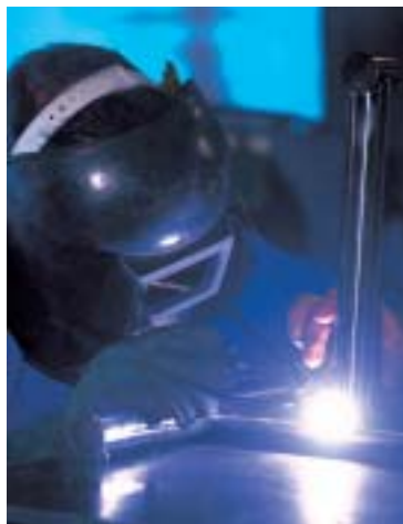
State-of-the-art production technology.