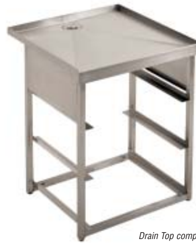
Drain Top complete with basket rack.

Bartender units can be designed and manufactured to client requirements.