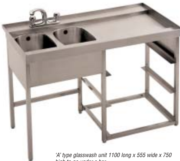
'A' type glasswash unit 1100 long x 555 wide x 750 high to go under a bar.