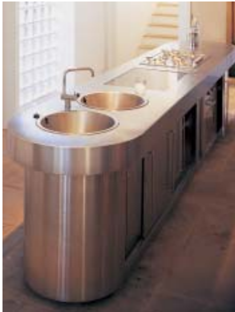
Stainless steel island kitchen suite complete with sliding door cupboard units with under work top.