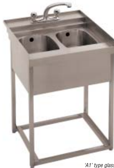
'A1' type glasswash sink complete with 1 pair of runners to take basket.