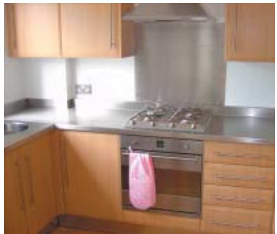
One of our projects.