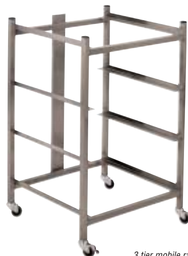
3 tier mobile rack (castors optional).